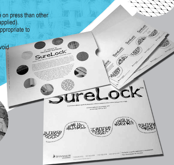
Literature with sample die cuts available

Contact your Sales Representative or our Technical Consulting Team (877-210-5104) for help when choosing the right product to fit your needs.